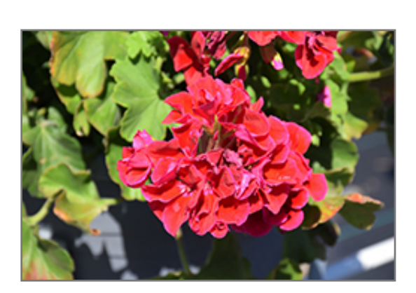
Calliope Medium Crimson Flame Geranium flowers

Medium sized flowers with stunning color; extremely well branched with a vigorous, mounding habit; ideal for large pots, containers, and landscape applications