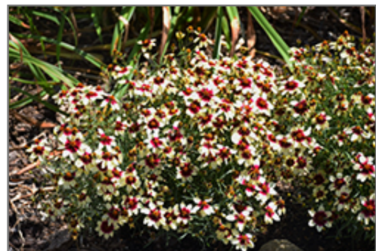
Sizzle And Spice Red Hot Vanilla Tickseed in bloom