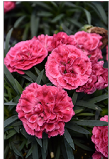
Fruit Punch Raspberry Ruffles Pinks flowers

Fruit Punch Raspberry Ruffles Pinks is recommended for the following landscape applications;