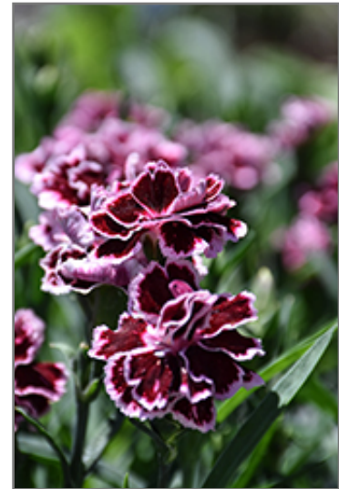
Odessa Pierrot Pinks flowers

Odessa Pierrot Pinks is recommended for the following landscape applications;