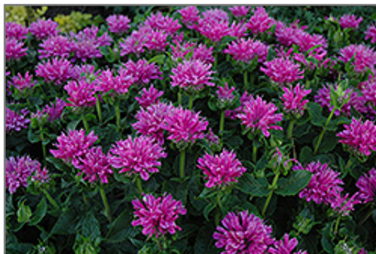
Petite Delight Beebalm flowers