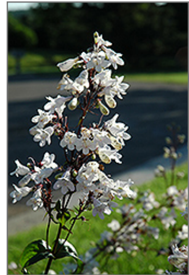
Husker Red Beard Tongue flowers