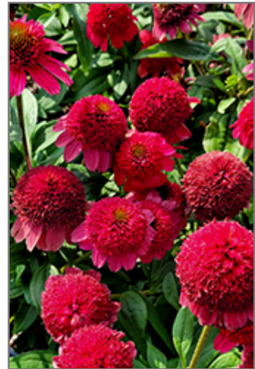
Sunny Days Ruby Coneflower flowers

This is a relatively low maintenance plant, and is best cleaned up in early spring before it resumes active growth for the season. It is a good choice for attracting butterflies to your yard, but is not particularly attractive to deer who tend to leave it alone in favor of tastier treats. It has no significant negative characteristics.