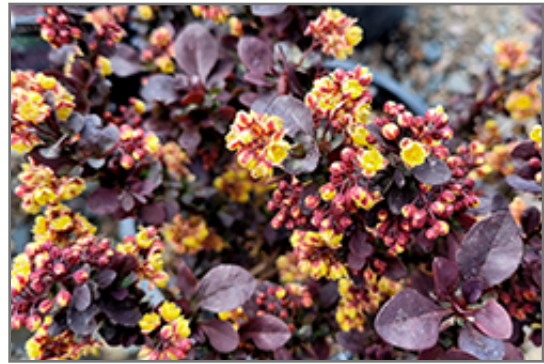
Concorde Japanese Barberry flowers

Concorde Japanese Barberry will grow to be about 18 inches tall at maturity, with a spread of 24 inches. It tends to fill out right to the ground and therefore doesn't necessarily require facer plants in front. It grows at a slow rate, and under ideal conditions can be expected to live for approximately 20 years.