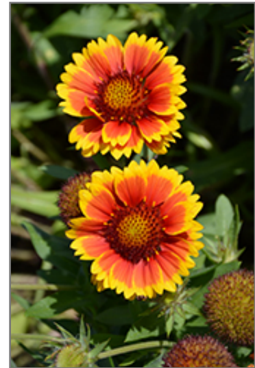
Arizona Sun Blanket Flower flowers

Arizona Sun Blanket Flower is recommended for the following landscape applications;