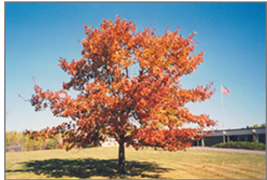
Red Oak in fall