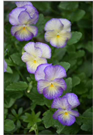
Etain Pansy flowers