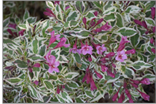
My Monet Weigela flowers

My Monet Weigela is recommended for the following landscape applications;