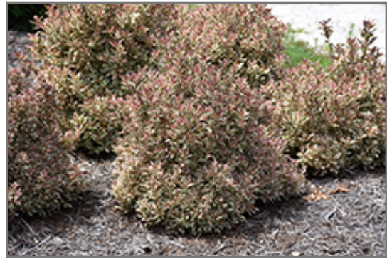
My Monet Weigela

My Monet Weigela makes a fine choice for the outdoor landscape, but it is also well-suited for use in outdoor pots and containers. It is often used as a 'filler' in the 'spiller-thriller-filler' container combination, providing a mass of flowers and foliage against which the thriller plants stand out. Note that when grown in a container, it may not perform exactly as indicated on the tag - this is to be expected. Also note that when growing plants in outdoor containers and baskets, they may require more frequent waterings than they would in the yard or garden.