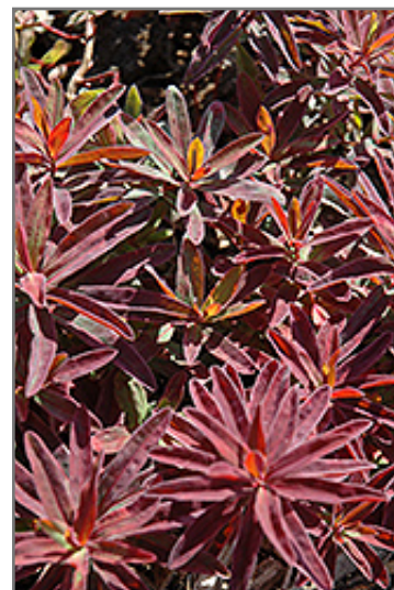
Bonfire Cushion Spurge foliage

Bonfire Cushion Spurge is recommended for the following landscape applications;