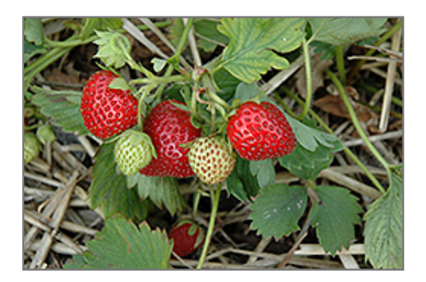
June-Bearing Strawberry fruit

This is an open herbaceous perennial with a spreading, ground-hugging habit of growth. Its relatively fine texture sets it apart from other garden plants with less refined foliage. This is a high maintenance plant that will require regular care and upkeep, and should not require much pruning, except when necessary, such as to remove dieback. It is a good choice for attracting birds and bees to your yard, but is not particularly attractive to deer who tend to leave it alone in favor of tastier treats. Gardeners should be aware of the following characteristic(s) that may warrant special consideration;