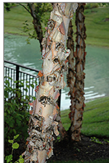
River Birch bark