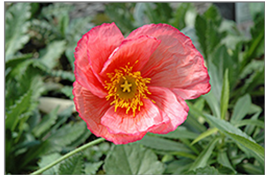
Champagne Bubbles Poppy flowers

Champagne Bubbles Poppy will grow to be only 6 inches tall at maturity extending to 18 inches tall with the flowers, with a spread of 18 inches. When grown in masses or used as a bedding plant, individual plants should be spaced approximately 14 inches apart. It grows at a fast rate, and under ideal conditions can be expected to live for approximately 3 years. As an herbaceous perennial, this plant will usually die back to the crown each winter, and will regrow from the base each spring. Be careful not to disturb the crown in late winter when it may not be readily seen! As this plant tends to go dormant in summer, it is best interplanted with late-season bloomers to hide the dying foliage.