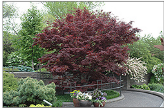
Bloodgood Japanese Maple