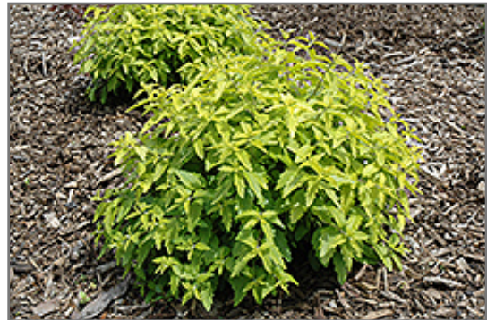
Sunshine Blue Caryopteris

Sunshine Blue Caryopteris is recommended for the following landscape applications;