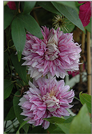
Josephine Clematis flowers

Josephine Clematis will grow to be about 10 feet tall at maturity, with a spread of 24 inches. As a climbing vine, it tends to be leggy near the base and should be underplanted with low-growing facer plants. It should be planted near a fence, trellis or other landscape structure where it can be trained to grow upwards on it, or allowed to trail off a retaining wall or slope. It grows at a medium rate, and under ideal conditions can be expected to live for approximately 20 years.