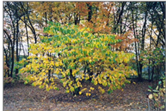
Northern Strain Redbud in fall

This tree does best in full sun to partial shade. It prefers to grow in average to moist conditions, and shouldn't be allowed to dry out. It is not particular as to soil type or pH. It is highly tolerant of urban pollution and will even thrive in inner city environments, and will benefit from being planted in a relatively sheltered location. Consider applying a thick mulch around the root zone in winter to protect it in exposed locations or colder microclimates. This is a selection of a native North American species.