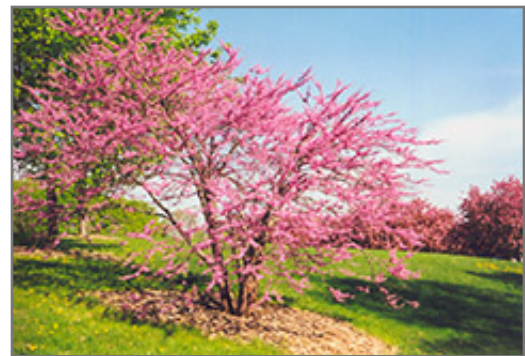
Northern Strain Redbud in bloom