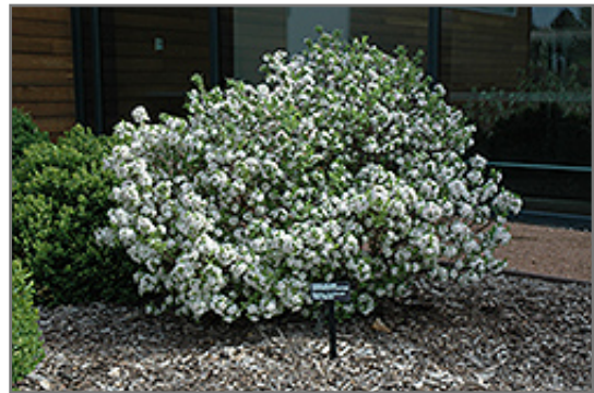
Carol Mackie Daphne in bloom