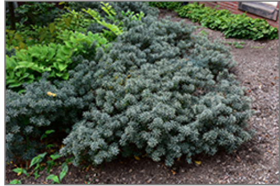
Carol Mackie Daphne

This shrub does best in full sun to partial shade. It prefers dry to average moisture levels with very well-drained soil, and will often die in standing water. It is not particular as to soil pH, but grows best in clay soils. It is somewhat tolerant of urban pollution, and will benefit from being planted in a relatively sheltered location. Consider applying a thick mulch around the root zone in winter to protect it in exposed locations or colder microclimates. This particular variety is an interspecific hybrid, and parts of it are known to be toxic to humans and animals, so care should be exercised in planting it around children and pets.