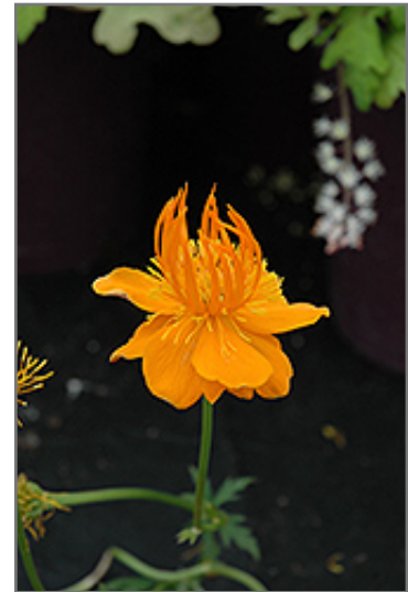
Superbus Globeflower flowers

Superbus Globeflower will grow to be about 18 inches tall at maturity extending to 24 inches tall with the flowers, with a spread of 18 inches. When grown in masses or used as a bedding plant, individual plants should be spaced approximately 14 inches apart. It grows at a medium rate, and under ideal conditions can be expected to live for approximately 10 years.