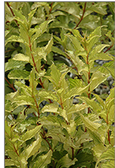
Ghost Weigela foliage