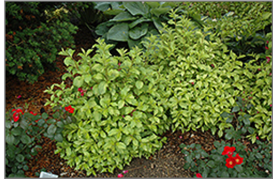
Ghost Weigela

This shrub should only be grown in full sunlight. It prefers to grow in average to moist conditions, and shouldn't be allowed to dry out. It is not particular as to soil type or pH. It is highly tolerant of urban pollution and will even thrive in inner city environments. This is a selected variety of a species not originally from North America.