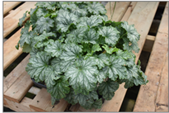
Paris Coral Bells foliage

Paris Coral Bells will grow to be about 8 inches tall at maturity extending to 14 inches tall with the flowers, with a spread of 14 inches. When grown in masses or used as a bedding plant, individual plants should be spaced approximately 12 inches apart. Its foliage tends to remain low and dense right to the ground. It grows at a medium rate, and under ideal conditions can be expected to live for approximately 10 years. As an evergreen perennial, this plant will typically keep its form and foliage year-round.