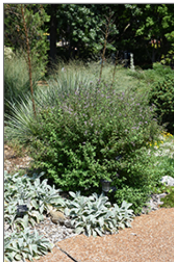
Leptodermis in bloom