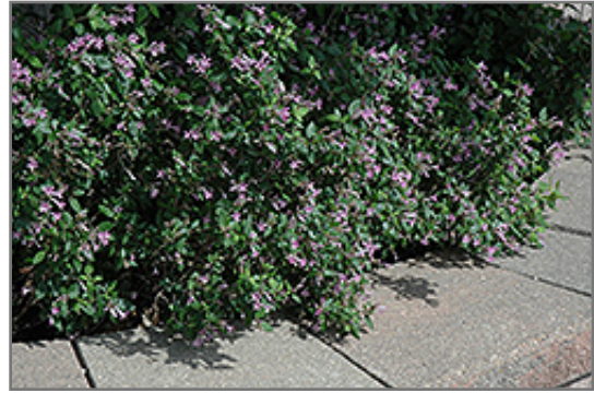
Leptodermis in bloom

This shrub does best in full sun to partial shade. It prefers to grow in average to moist conditions, and shouldn't be allowed to dry out. It is not particular as to soil type or pH. It is somewhat tolerant of urban pollution. This species is not originally from North America.