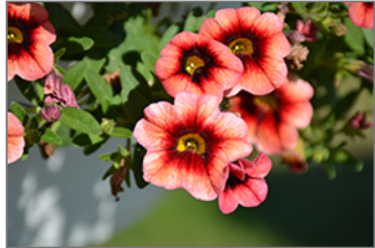
Superbells Coralberry Punch Calibrachoa flowers

Superbells Coralberry Punch Calibrachoa is a dense herbaceous annual with a trailing habit of growth, eventually spilling over the edges of hanging baskets and containers. Its medium texture blends into the garden, but can always be balanced by a couple of finer or coarser plants for an effective composition.