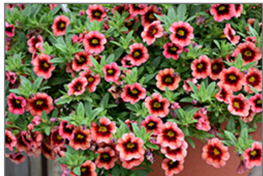
Superbells Coralberry Punch Calibrachoa flowers