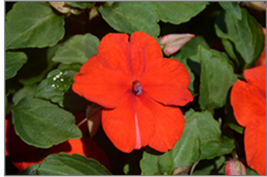
Super Elfin XP Scarlet Impatiens flowers

Super Elfin XP Scarlet Impatiens is recommended for the following landscape applications;