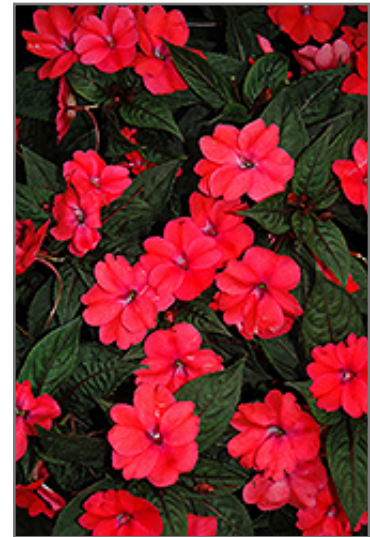
SunPatens Compact Deep Rose New Guinea Impatiens flowers

This plant will require occasional maintenance and upkeep, and should not require much pruning, except when necessary, such as to remove dieback. It is a good choice for attracting bees and butterflies to your yard. It has no significant negative characteristics.