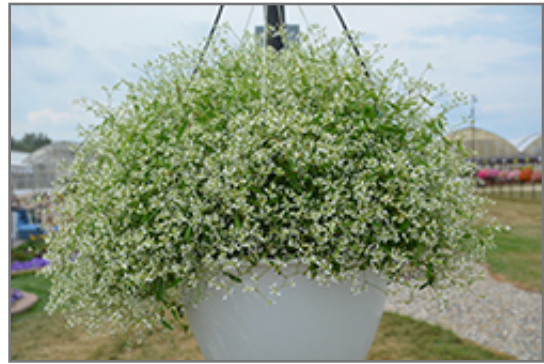
Diamond Frost Euphorbia in bloom

Diamond Frost Euphorbia is a fine choice for the garden, but it is also a good selection for planting in outdoor containers and hanging baskets. It is often used as a 'filler' in the 'spiller-thriller-filler' container combination, providing a mass of flowers against which the thriller plants stand out. Note that when growing plants in outdoor containers and baskets, they may require more frequent waterings than they would in the yard or garden.