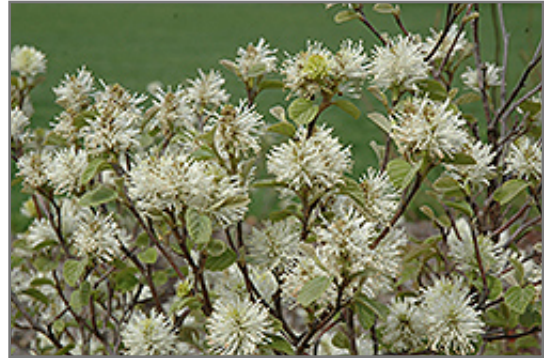
Dwarf Fothergilla flowers

This shrub does best in full sun to partial shade. It requires an evenly moist well-drained soil for optimal growth, but will die in standing water. It is not particular as to soil type, but has a definite preference for acidic soils, and is subject to chlorosis (yellowing) of the foliage in alkaline soils. It is somewhat tolerant of urban pollution. This species is native to parts of North America.