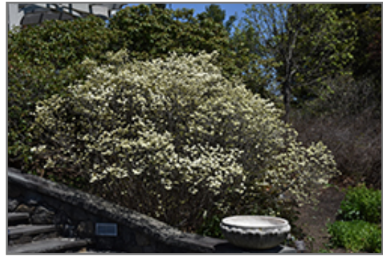
Dwarf Fothergilla in bloom

Dwarf Fothergilla is recommended for the following landscape applications;