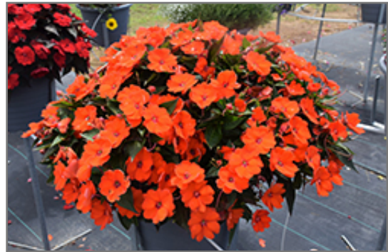
SunPatiens Compact Electric Orange New Guinea Impatiens in bloom

SunPatiens Compact Electric Orange New Guinea Impatiens is a fine choice for the garden, but it is also a good selection for planting in outdoor containers and hanging baskets. It can be used either as 'filler' or as a 'thriller' in the 'spiller-thriller-filler' container combination, depending on the height and form of the other plants used in the container planting. It is even sizeable enough that it can be grown alone in a suitable container. Note that when growing plants in outdoor containers and baskets, they may require more frequent waterings than they would in the yard or garden.