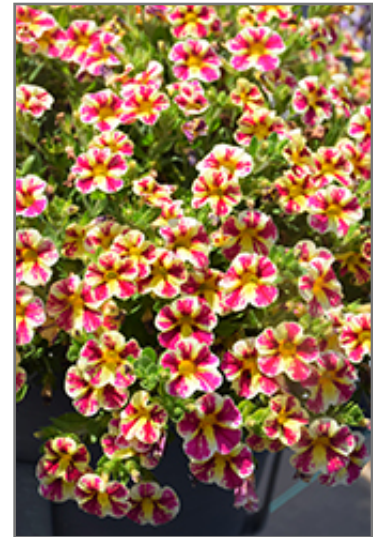
Superbells Holy Moly! Calibrachoa flowers

This plant will require occasional maintenance and upkeep. Trim off the flower heads after they fade and die to encourage more blooms late into the season. It is a good choice for attracting bees and hummingbirds to your yard, but is not particularly attractive to deer who tend to leave it alone in favor of tastier treats. It has no significant negative characteristics.