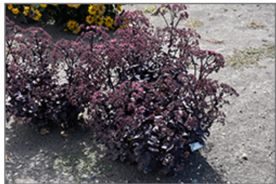
Cherry Truffle Stonecrop in bloom