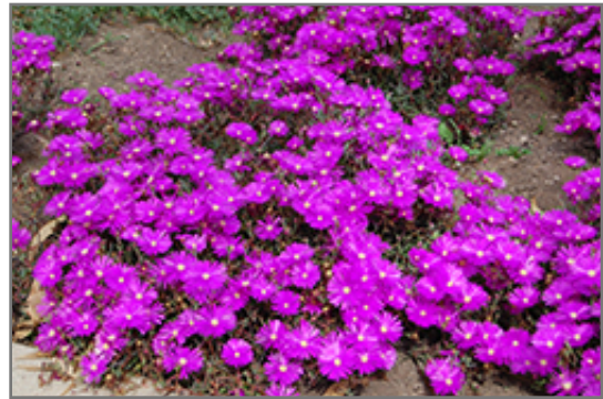
Jewel Of Desert Opal Ice Plant in bloom

Jewel Of Desert Opal Ice Plant will grow to be only 4 inches tall at maturity extending to 6 inches tall with the flowers, with a spread of 10 inches. When grown in masses or used as a bedding plant, individual plants should be spaced approximately 10 inches apart. Its foliage tends to remain low and dense right to the ground. It grows at a fast rate, and under ideal conditions can be expected to live for approximately 5 years. As an evergreen perennial, this plant will typically keep its form and foliage year-round.