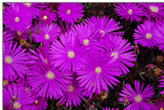
Jewel Of Desert Opal Ice Plant flowers