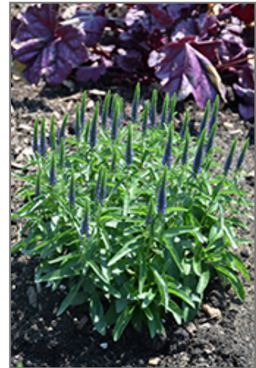
Magic Show Wizard of Ahhs Speedwell in bloom

Magic Show Wizard of Ahhs Speedwell is a fine choice for the garden, but it is also a good selection for planting in outdoor pots and containers. It is often used as a 'filler' in the 'spiller-thriller-filler' container combination, providing a mass of flowers against which the larger thriller plants stand out. Note that when growing plants in outdoor containers and baskets, they may require more frequent waterings than they would in the yard or garden.