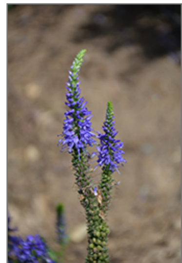
Magic Show Wizard of Ahhs Speedwell flowers