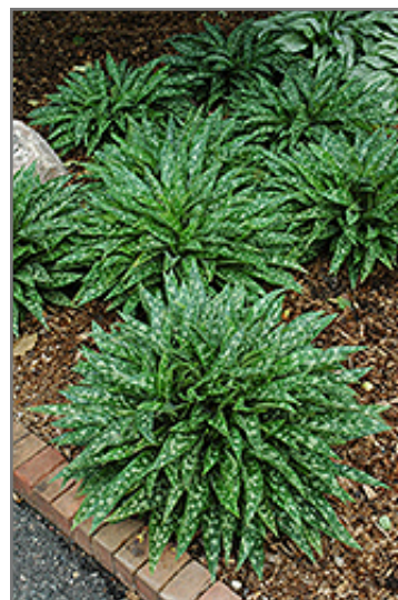
Raspberry Splash Lungwort