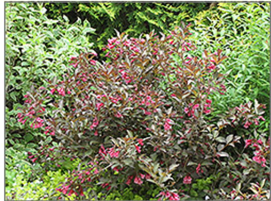
Midnight Wine Weigela in bloom