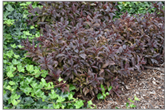
Midnight Wine Weigela

Midnight Wine Weigela makes a fine choice for the outdoor landscape, but it is also well-suited for use in outdoor pots and containers. It is often used as a 'filler' in the 'spiller-thriller-filler' container combination, providing a mass of flowers and foliage against which the thriller plants stand out. Note that when grown in a container, it may not perform exactly as indicated on the tag - this is to be expected. Also note that when growing plants in outdoor containers and baskets, they may require more frequent waterings than they would in the yard or garden.