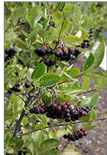
Iroquois Beauty Black Chokeberry fruit