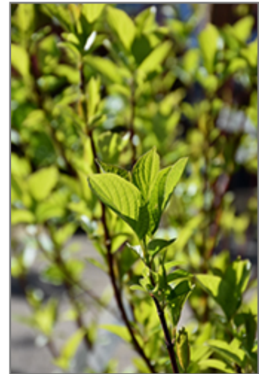
Bailey Red-Twig Dogwood foliage

This shrub does best in full sun to partial shade. It is an amazingly adaptable plant, tolerating both dry conditions and even some standing water. It is not particular as to soil type or pH. It is highly tolerant of urban pollution and will even thrive in inner city environments. This species is native to parts of North America.