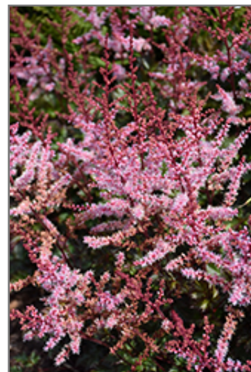
Delft Lace Astilbe flowers

This is a relatively low maintenance plant, and is best cleaned up in early spring before it resumes active growth for the season. It is a good choice for attracting butterflies to your yard, but is not particularly attractive to deer who tend to leave it alone in favor of tastier treats. It has no significant negative characteristics.