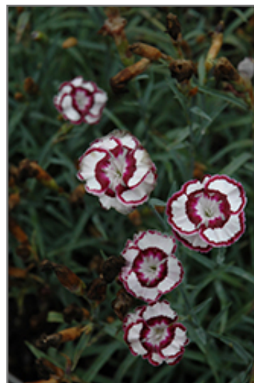
Raspberry Swirl Pinks flowers

Raspberry Swirl Pinks is recommended for the following landscape applications;