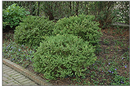
Wintergreen Boxwood