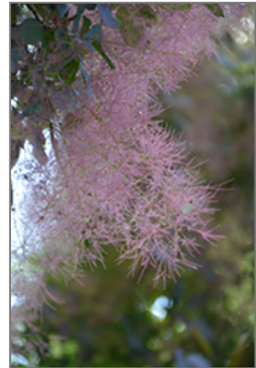
Royal Purple Smokebush flowers

This shrub should only be grown in full sunlight. It is very adaptable to both dry and moist locations, and should do just fine under average home landscape conditions. It is not particular as to soil type or pH. It is highly tolerant of urban pollution and will even thrive in inner city environments, and will benefit from being planted in a relatively sheltered location. This is a selected variety of a species not originally from North America.