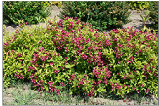
Ghost Weigela in bloom

This shrub should only be grown in full sunlight. It prefers to grow in average to moist conditions, and shouldn't be allowed to dry out. It is not particular as to soil type or pH. It is highly tolerant of urban pollution and will even thrive in inner city environments. This is a selected variety of a species not originally from North America.