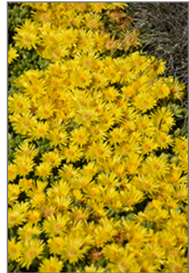
Yellow Ice Plant flowers

Yellow Ice Plant is recommended for the following landscape applications;